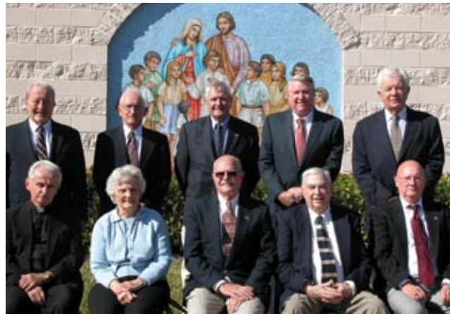
LSRP, Inc. Board of Directors

As a member, the Board of Directors will work collaboratively to ensure you receive the most from your membership.